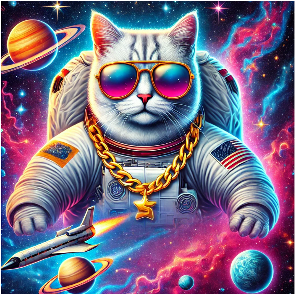
Figure 2.1: An amazing cat.